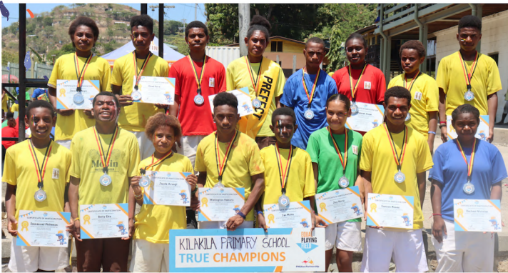
Kila Kila Primary School True Champions