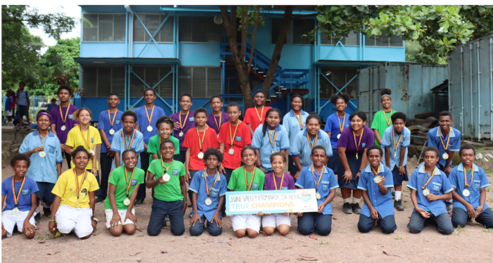
June Valley Primary School True Champions