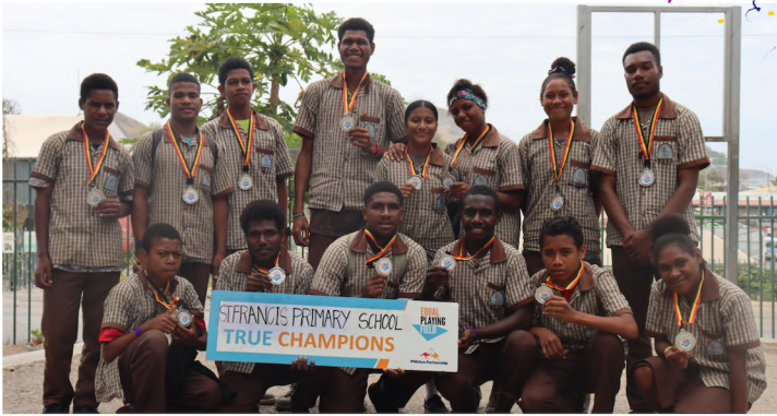
St. Francis Primary School True Champions