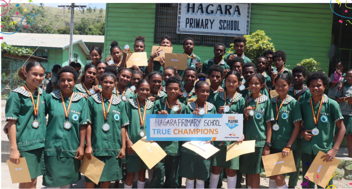
Hagara Primary School True Champions